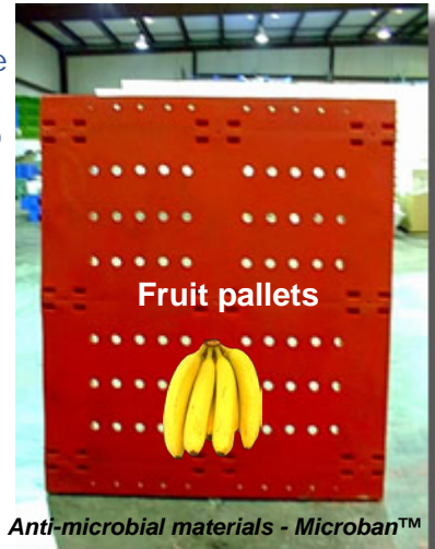
Anti-microbial materials - Microban™

Ideal for -20°C to hot steam cleaning in repetitive use