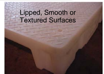
Lipped, Smooth or Textured Surfaces