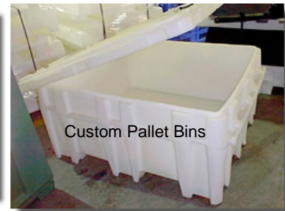
Custom Pallet Bins